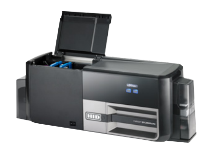
One- or Two-Material Option Only the DTC5500LMX offers one-or two-material options, allowing for automated dual-side lamination without the dual-side price.