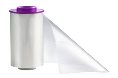
High Durability – Low Cost PolyGuard<sup>™</sup> LMX wasteless overlaminates allow for up to 50% lower consumables costs, reducing your total cost of ownership.

The DTC5500LMX offers single- or duallaminate material configurations to best fit your lamination needs. When only a single lamination material is desired for either the front or both the front and back of your card, the single laminate material configuration may be utilized. For example, a corporate employee ID may only require a clear laminate patch on the front of the card for enhanced durability.